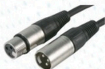
XLR M/F PAIR