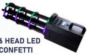
6 HEAD LED CONFETTI FIRING GUN