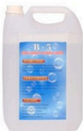
BUBBLE LIQUID 5 LTRS/ SNOW LIQUID 5 LTRS