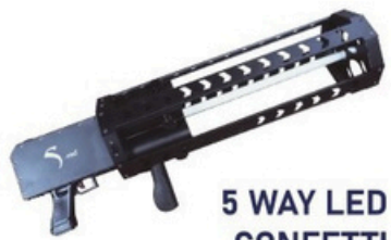
5 WAY LED CONFETTI FIRING GUN