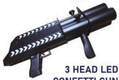
3 HEAD LED CONFETTI GUN