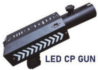
LED CP GUN