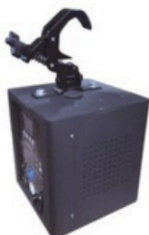
SPARKULAR FALL SUPER SFX