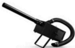
ELECTRIC CONFETTI BLOWER