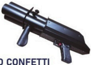
3 HEAD CONFETTI FIRING GUN