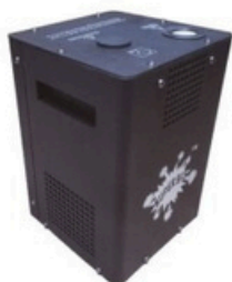
SPARKULAR SUPER SFX