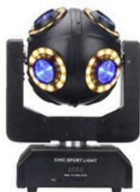
LED AURA FOOTBALL