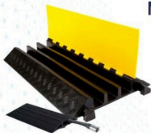
CABLE RAMP/ CABLE RUBBER MAT