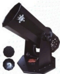
ELECTRIC CONFETTI BLOWER SUPER