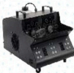
LED SMOKE BUBBLE MACHINE