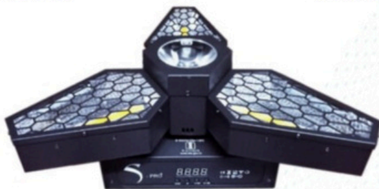
3 WING FINE