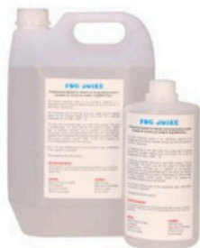
FOG JUICE 1/5 LTR