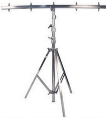
STAINLESS STEEL STAND (12FEET)