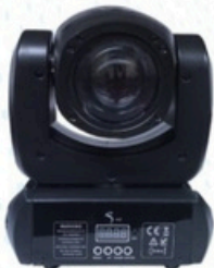
100W LED SHARPY (NEW)